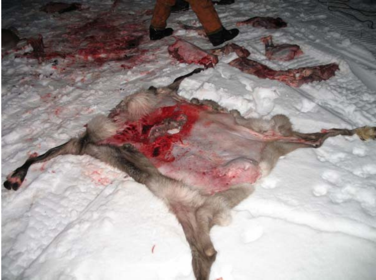
The skin of the vazhenka killed by a wolverine. The hole in the middle of the back is where the predator had severed the spine and paralyzed the animal